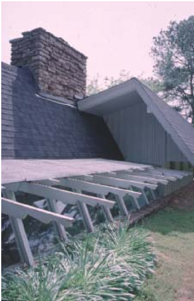
Harmon House.