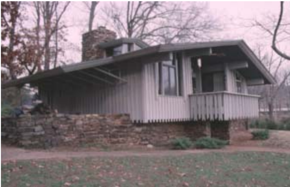
Cherokee Village Townhouse.

ideal. For instance, there was the need for architecture to transcend mere building to become art: “You could have [a design] very mechanistically diagrammed out and you could build box-like things that [serve the need for shelter], but that’s mere building—that’s just construction. Technically it might be all right, but it’s not architecture. Architecture has got to transcend that some way.” 97