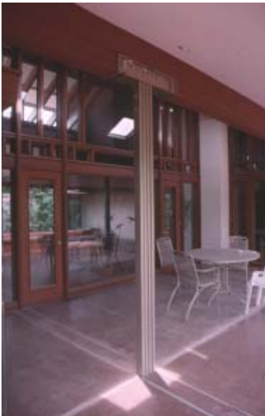
Nelms House.

A more typical “problem” for Jones was the rural lakeside site of Pine Eagle, the tiny (500 square feet) chapel/multi-purpose pavilion he designed for a Boy Scout camp. At the chapel’s dedication in November of 1991, Jones said the small structure “attempts to align itself with the earth, the water, and the sky . . . with the wonderful bounties of nature.” 86 Robert Ivy asserts that Pine Eagle captured “the spiritual qualities of transcendence and imminence in its frame. The structure both points upward-aligning itself with universal, timeless forces-and opens outward-framing the immediate world like a Zen window.” 87 Pine Eagle was just one more example of Fay Jones’s enormous gift, in Vernon Reed’s words, for ordering “every piece of building material into a magic web. . . .” 88