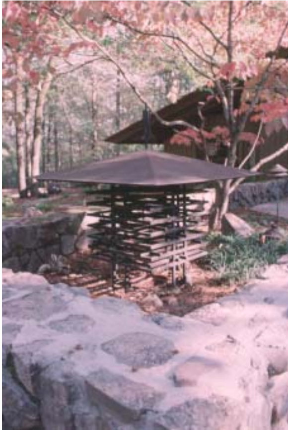
Tanner House detail.

materials (especially wood and stone), integration of ornament into the overall design, expressed structure, and repetition of forms.