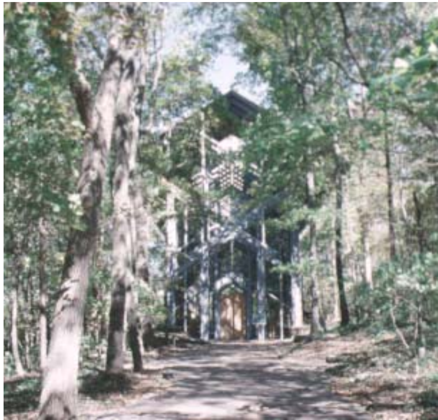
Thorncrown Chapel, Eureka Springs, Carroll County.