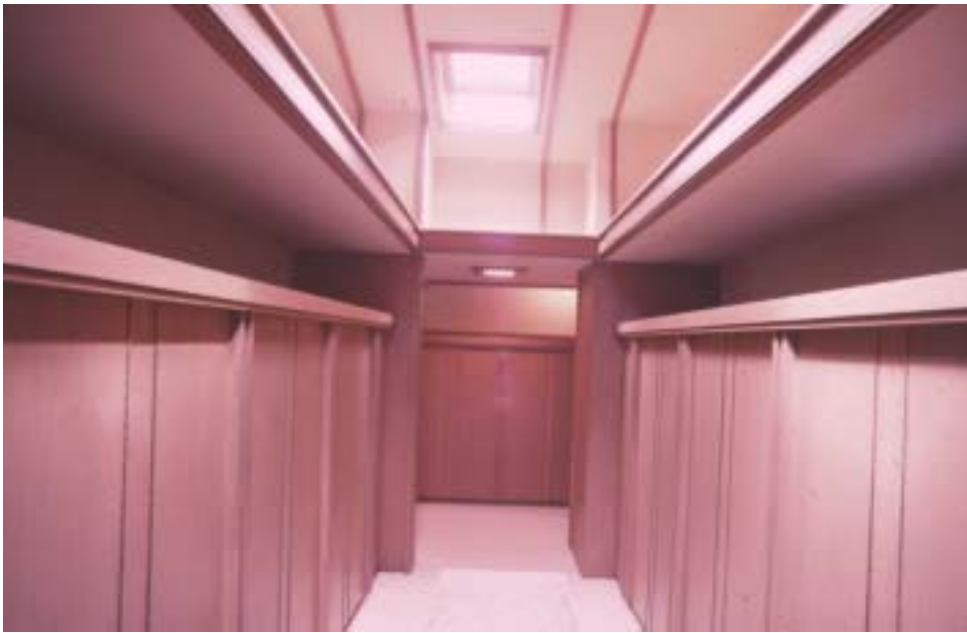
Alexander House interior.