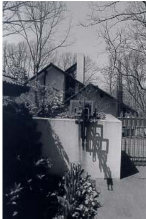
The Edmondson House

Published by the Arkansas Historic Preservation Program 1500 Tower Building, 323 Center Street, Little Rock, AR 72201 (501) 324-9880 An agency of the Department of Arkansas Heritage