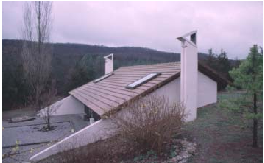
The Hermitage.

The award was presented to Fay Jones at a ceremony held at the National Building Museum in Washington, D. C. on the evening of February 22, 1990. During the afternoon, he was praised by President George Bush at a White House reception. “Jones has created a truly American architecture that is respected the world over,” said the president. 77 That night, Prince Charles of Great Britain, in Washington to take part in an AIA conference being held in conjunction with the Gold Medal ceremony, also praised Jones’s buildings for evoking “the amplitude of nature without damaging nature.” 78