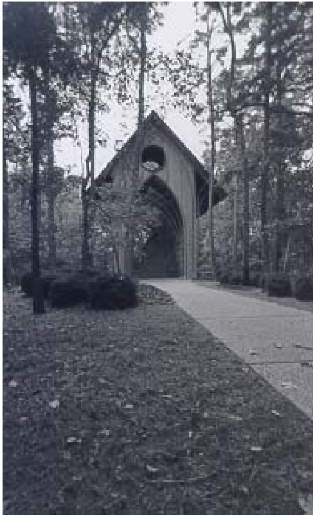
Mildred B. Cooper Memorial Chapel, Bella Vista, Benton County.