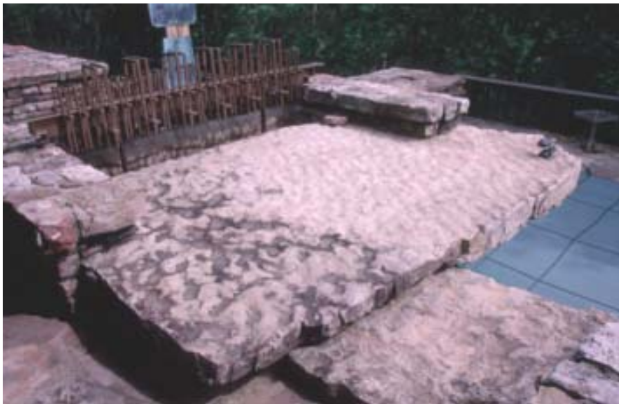
Alexander House detail.

Agreeing with his mentor, with whom he frequently has been compared, Fay Jones said, "We must not reduce architecture to fashion design. Fashion in architecture is beside the point." 36 Also like Wright, Jones always aimed to ensure that his buildings fit . He once wrote that in organic architecture, "nothing is superfluous, and everything justifies itself by contributing to [a] central generating idea. Frank Lloyd Wright summed it up: 'The whole is to the part as the part is to the whole.'" 37