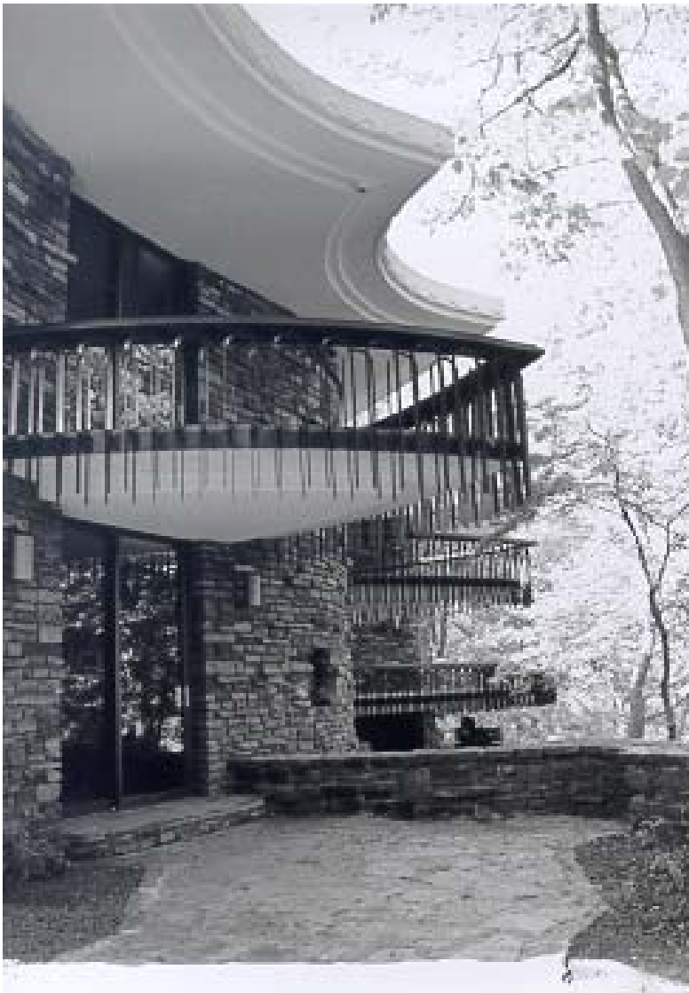
The Applegate House, Bentonville, Benton County. AHPP photo.