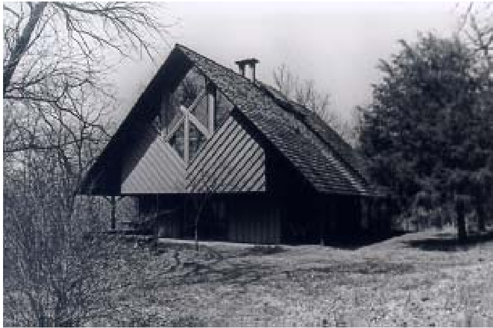
Reed House, Washington County.