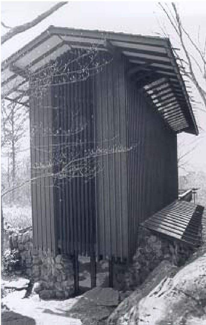
Shaheen-Goodfellow Weekend Cottage, Eden Isle, Cleburne County.