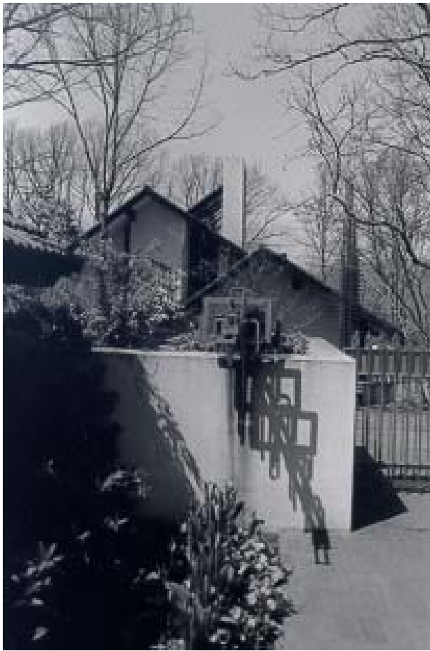
The Edmondson House, Forrest City, St. Francis County.