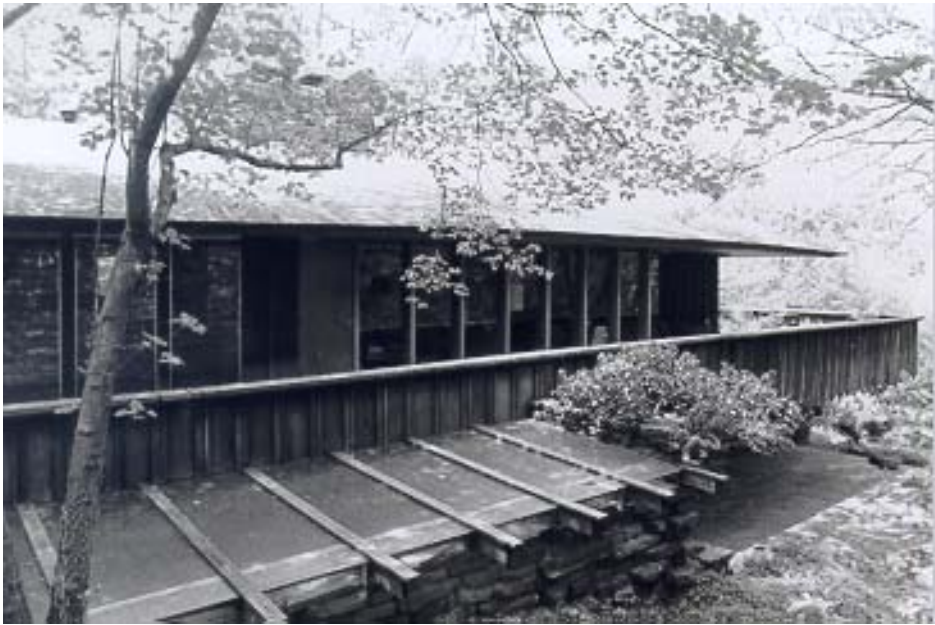
The E. Fay and Gus Jones House, Fayetteville, Washington County.