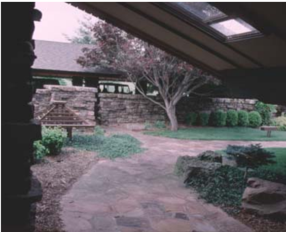
Raheen.

For its entire history, Arkansas has been-relative to the rest of the U.S.-a poor and poorly-educated state with a small population. Better known for its natural attractions than its man-made ones, Arkansas has an architectural legacy that is much different from older and more affluent states-and one that is not nearly so well documented. Only now is a book on the state’s architecture underway. 112