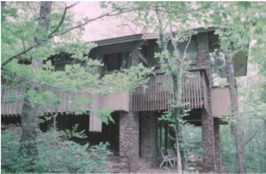
Goetsch-Winkler House.