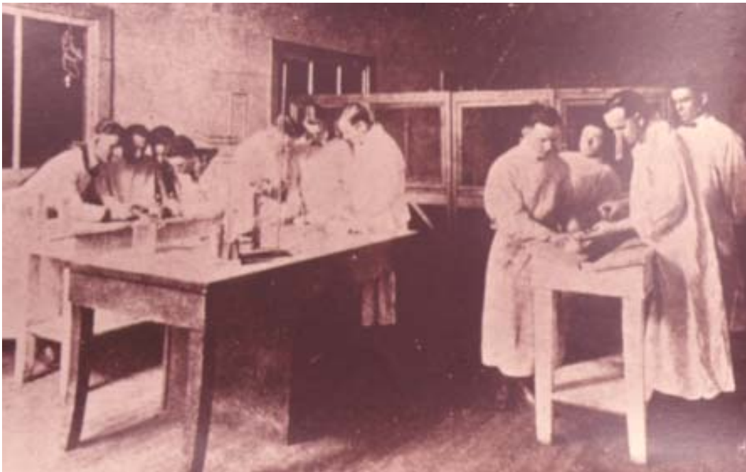
Pharmacology lab, University of Arkansas Medical School, ca. 1924.

He further suggested that the state university be moved from Fayetteville to Little Rock where the two medical schools might be combined into one institution better than either, and affiliated officially with the University of Arkansas. Although discussion along those lines had for some time taken place within the Medical Society of Arkansas, the explosive nature of the "Flexner Report" galvanized rival factions into a course of action.