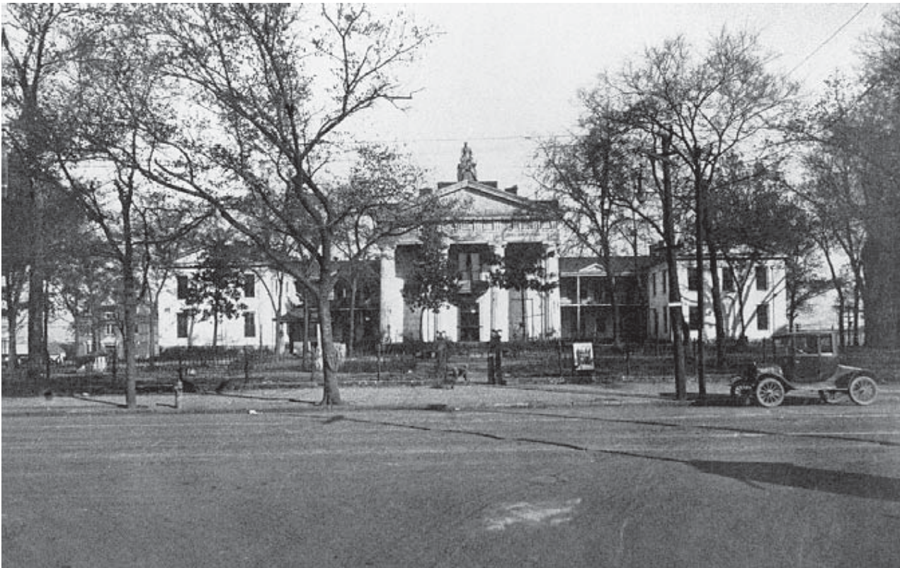
The Old State House, ca. 1917.

with a salt-substance or “niter-cake” which inhibited the mosquito breeding.