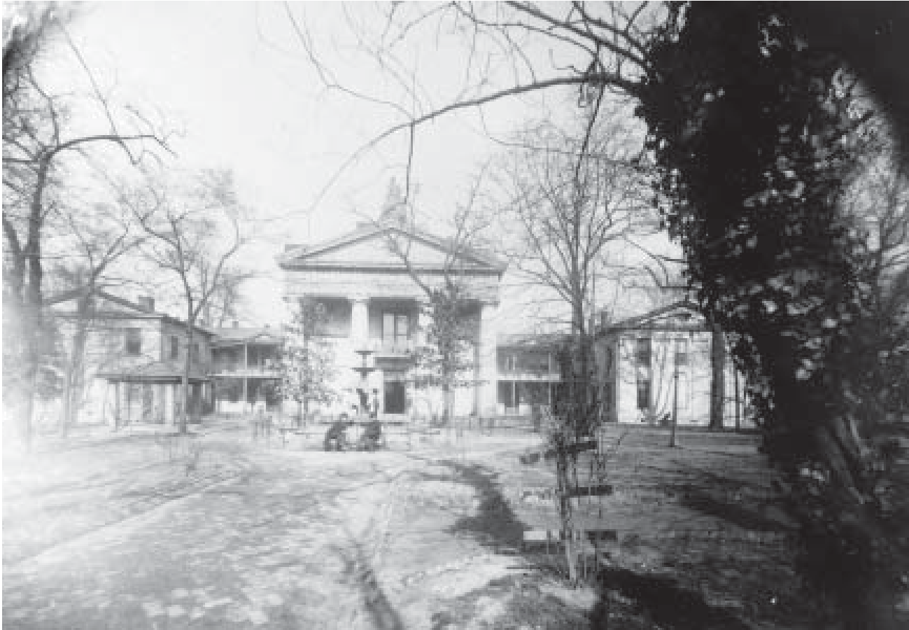
The Old State House, ca. 1910.

At last, in 1913, Act 96 was introduced in the House and passed with a comfortable majority. In the Senate, however, opposing arguments from unorthodox medical cultists slowed proceedings until, in the wake of another smallpox outbreak in the northwestern part of the state, the members of women's clubs poured letters and telegrams to the senators demanding the passage of Act 96. After another deluge of telegrams from women and another bitter session in the legislature during which the Rockefeller field workers came to Little Rock to lobby for passage of Act 96, Governor Joe T. Robinson signed the bill into law. 27