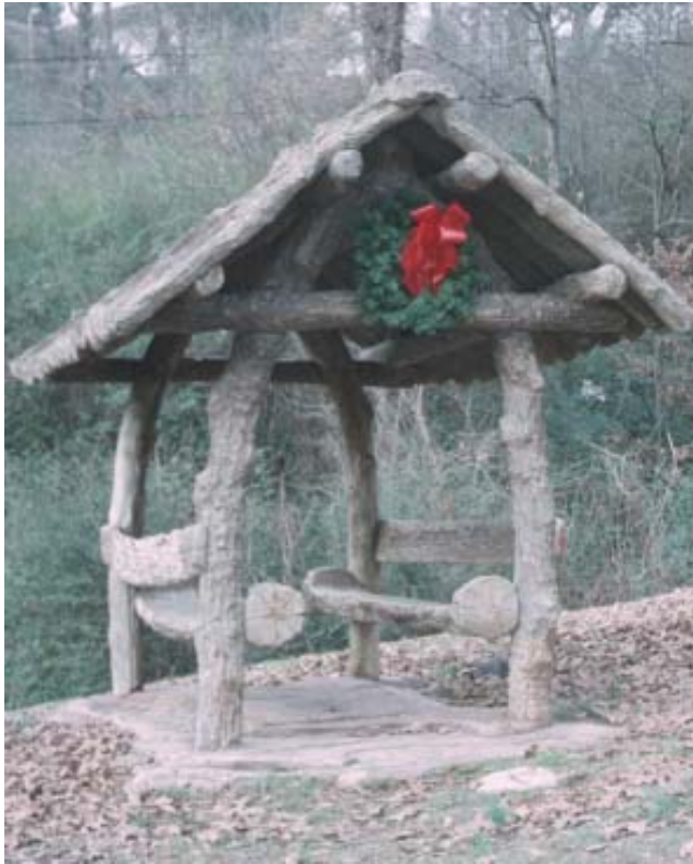
Crestview Park sculpture.