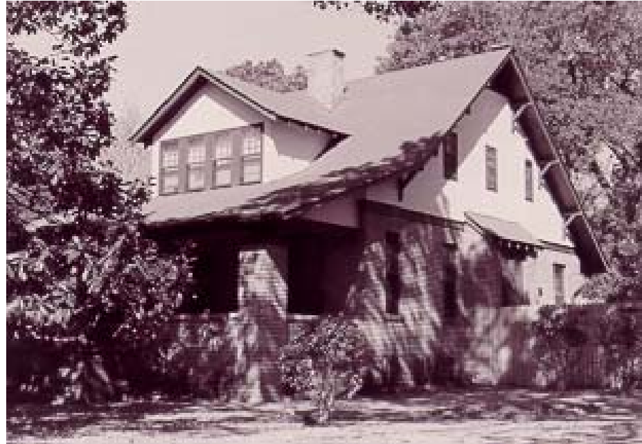
225 East "A" Street, Park Hill Historic District, North Little Rock.

The Craftsman Bungalow is the type of house most often built in Park Hill in the 1920s. The American Craftsman Bungalow became the "cottage" of the early decades of the twentieth century. A wide diversity of stylistic influences show links with many popular American architectural styles. The American Bungalow adapted itself to widely divergent environmental and climatic conditions, made use of numerous kinds of local building materials and ranged in size from rambling weekend retreats to small, low-income residences. During the rapid growth of Park Hill in the 1920s, sixty-one small-scale Craftsman Bungalows were constructed. Although there are several different variations of 1920s Bungalows in Park Hill, a common theme in their design links them. The Bungalow is set low to the ground; it nestles into and becomes part of its environment. The house at 315 West "F" is an example of the compatibility of the Bungalow with its setting.