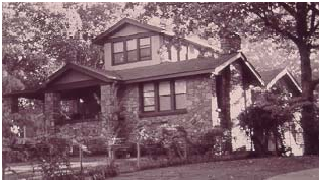
3216 Poplar Street, Park Hill Historic District, North Little Rock.

Another form of the cross-gabled roof type Bungalows is most often associated with “California Bungalows.” These houses all incorporate multiple roof planes, Oriental-like flared rooflines, and prominent triangular knee braces supporting wide eaves with extended rafter tails. A variation of the “California Bungalow” features a single second-story room affording a panoramic view of the sky, hence the name “Airplane Bungalow.” The houses at 3216 Poplar and 3614 Ridge Road display this characteristic hipped roof second story room with wide eaves and accentuated exposed rafter ends along with the typical porte cochere and short battered columns on brick piers.