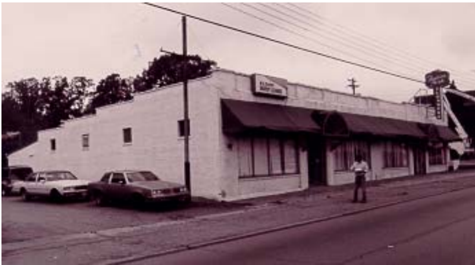
3723 John F. Kennedy Boulevard, Park Hill Historic District, North Little Rock.

Of the nineteen buildings in the district constructed for commercial use, only one was constructed prior to 1950. The building at 3723 J.F.K. Blvd. was built to house two retail establishments. For many years a grocery store occupied the southern portion of the building. The entire building is now occupied by a dry-cleaning company that began business in a small space on the north side of this building in the 1950s. Most of the commercial structures, all located along J.F.K. Boulevard, were constructed in the 1960s when fast-food restaurants became popular. Some of the largest picturesque Period Revival homes in Park Hill were demolished for construction of one of the first McDonald's restaurants in Arkansas. Located at 3217 J.F.K. Blvd., construction of McDonald's was soon followed by a Kentucky Fried Chicken restaurant next door at 3101 J.F.K. Blvd. Other commercial buildings were built in the 1960s and 1970s to accommodate professional offices. Two branch banks were also constructed on J.F.K. Boulevard in this time period. A number of the original 1920s residences located along this thoroughfare have been converted to commercial use and now house professional offices and a variety of specialty retail shops.