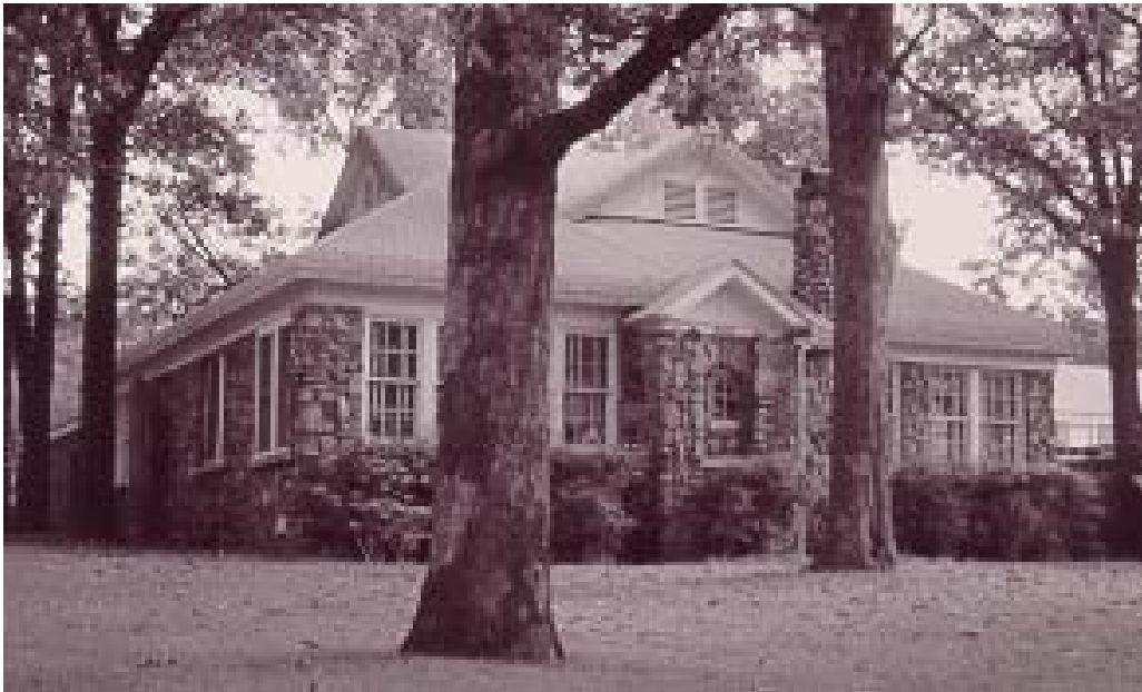
135 Crestview Street, Park Hill Historic District, North Little Rock.

The largest group of “Period Revival” houses in the Park Hill Historic District falls into the English Revival category. In the 1920s more than fifty houses of English Revival style were constructed in Park Hill. As seen in the neighborhood’s other styles, English Revival style houses in Park Hill were small versions best expressed as the “English Cottage.” One-story brick homes with steeply pitched gable roofs and prominent front facing gable porches, tapered chimneys on front facades and a mix of materials such as stone and bricks are commonly seen in the Park Hill neighborhood.