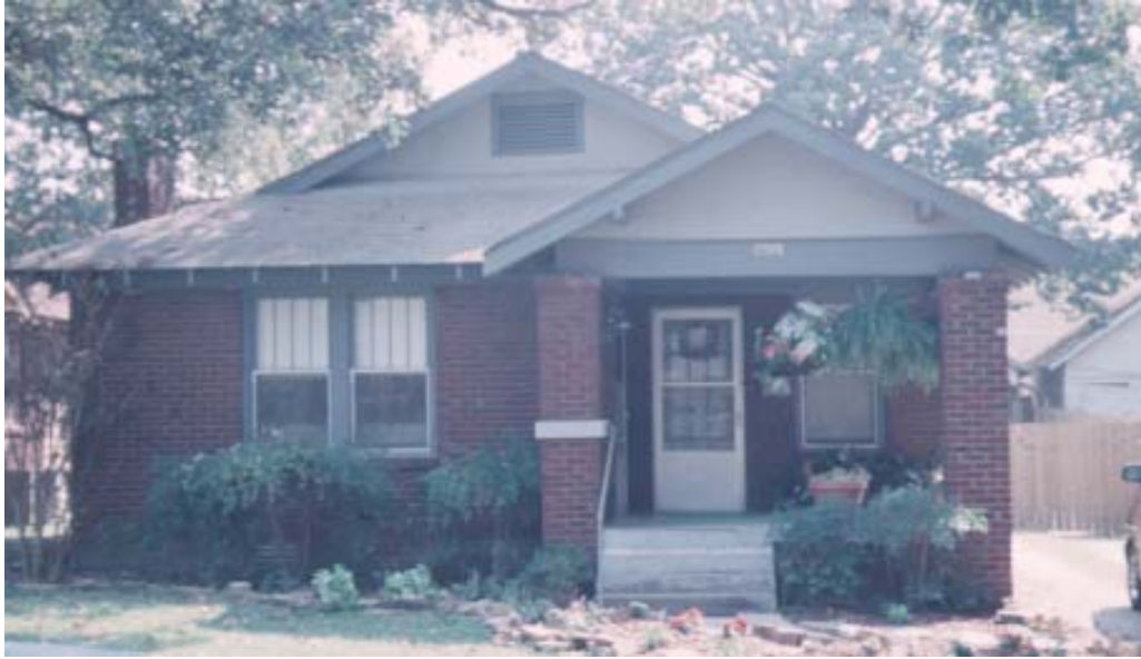
3318 Cypress Street, Park Hill Historic District, North Little Rock.

“G,” 3318 Cypress and 3317 Poplar. Employing a variety of Craftsman details such as multiple roof planes and horizontal bands of windows, these houses feature clipped gable and gable roofs and combinations of rustic materials such as natural stone and rough-hewn timbers in their detailing. The houses located at 3401 and 3405 Olive are examples of the most commonly seen Bungalow form in Park Hill. These houses are brick veneered with front facing gable roofs and porches with cross gable roofs and utilize stucco on the walls of the prominent gable ends.