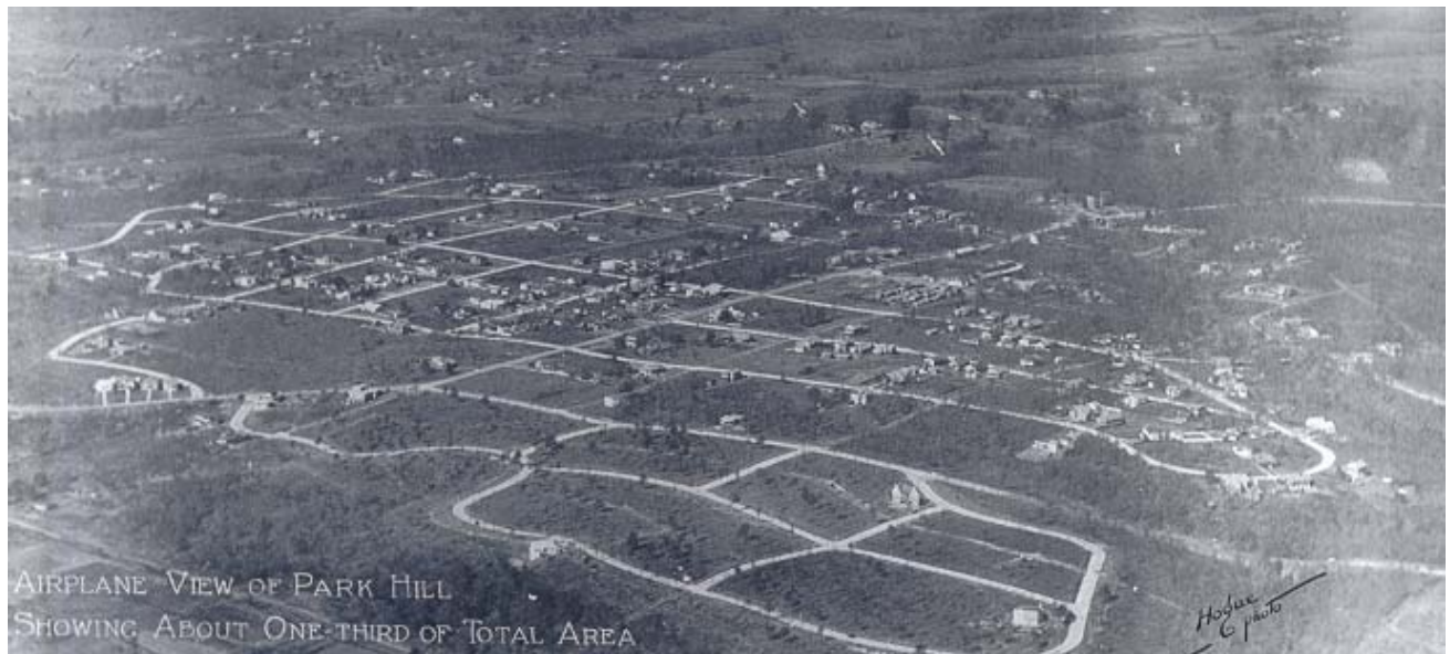
Aerial View of Park Hill, ca. 1920

Published by the Arkansas Historic Preservation Program 1500 Tower Building, 323 Center Street, Little Rock, AR 72201 (501) 324-9880