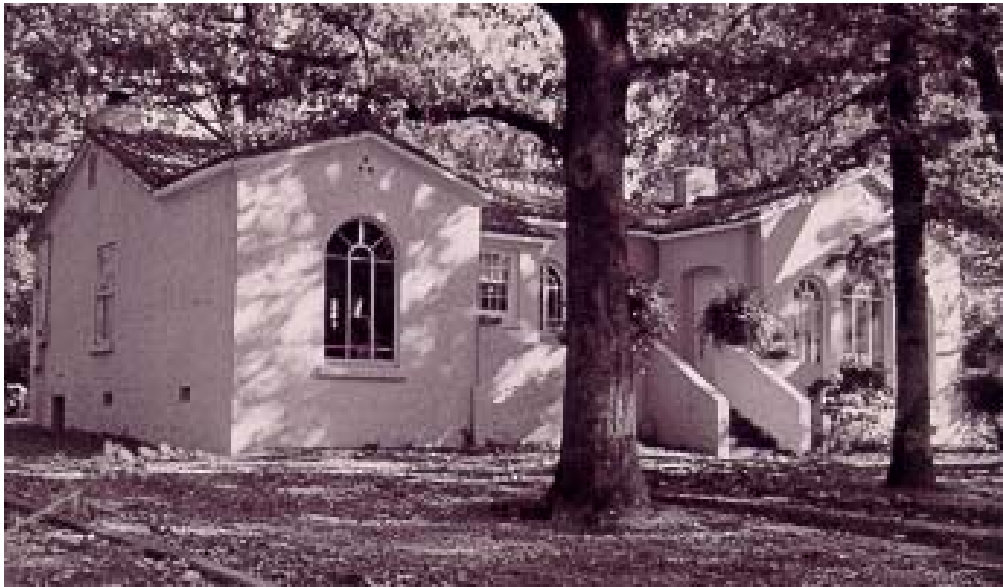
515 West "F" Street, Park Hill Historic District, North Little Rock.

There are eight "Spanish Revival" style houses in the Park Hill Historic District. Stucco walls, terraces and patios, flat roofs with raised tile ridged parapets, arcaded wing walls, and decorative use of ceramic tiles exemplify the 1920s period adaptation of the historic Spanish style. Examples of Spanish Revival influenced designs in Park Hill houses include 505 West "F" Street, 501 West "F," 237 East "A" and 3617 Ridge Road. After architect/designer Frank Carmean was brought into the Justin Matthews Co., this style house was offered to the buyer. However, most of the grand-scale Spanish Revival style homes in Park Hill were constructed in the more affluent Edgemont section of the neighborhood.