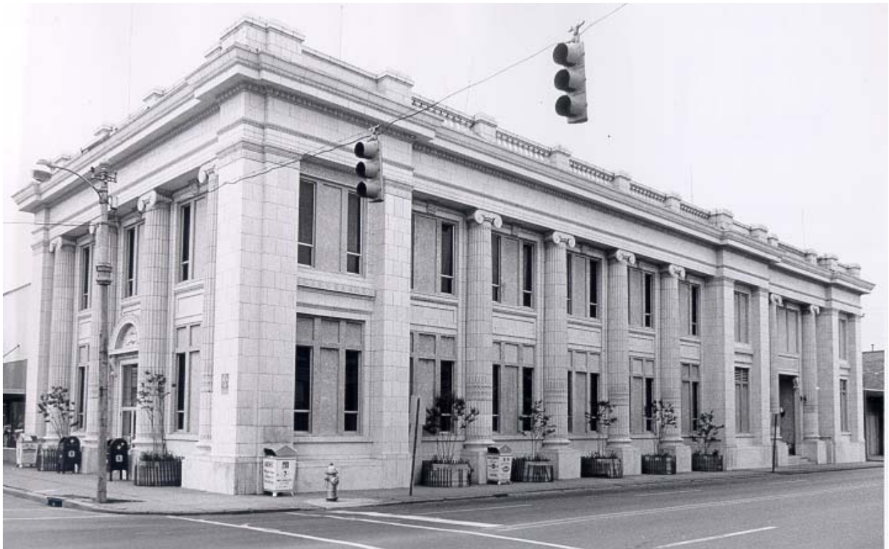
North Little Rock City Hall.

of North Little Rock applied to annex Little Rock's Eighth Ward (formerly the Town of Argenta). Little Rock strongly objected to the annexation application and after many months of dispute the issue went to the Arkansas Supreme Court where it was upheld: North Little Rock could annex the Eighth Ward of Little Rock. In 1904 the City of North Little Rock annexed Argenta and once again the north side of the river was its own city.