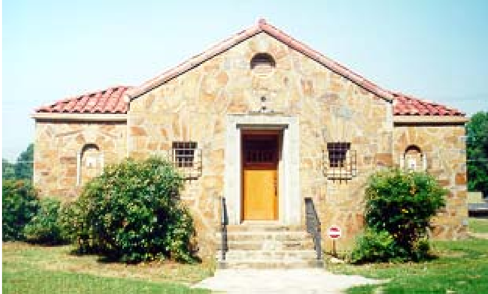
Park Hill Water Company Building.

The local architectural firm of Brueggeman, Swaim and Allen designed the Fire Station and Water Company buildings. The design of both buildings was strongly influenced by the Mediterranean style as seen by the red tile roofs, arched windows and decorative cast concrete detailing. Constructed at the same time were two 100 foot by 44 foot concrete water reservoirs and two fieldstone pump houses. Located in the western region of Park Hill, this complex occupies ten lots in the middle of Block 33 of the Park Hill Addition. Now owned by the City of North Little Rock, this historic complex remains an important landmark in the Park Hill neighborhood.